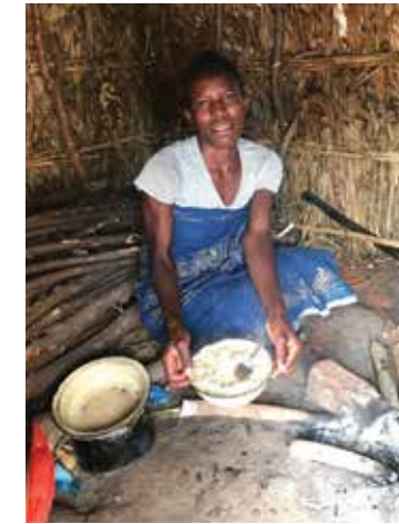
Just one bowl of food, and we could see the relief and gratitude in this woman's eyes.