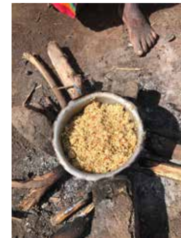
The fortified rice meals are filling, nutritious and delicious!