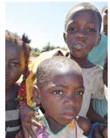
You have shown these children that God is good through your compassion and action.