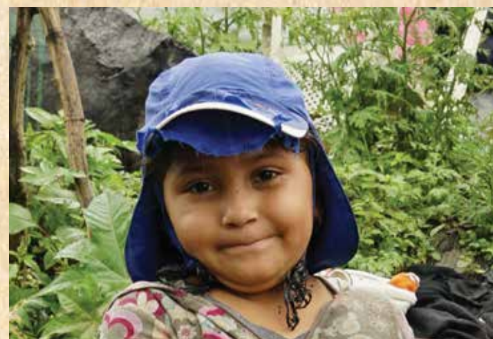
Because of the nourishing meals you send, children in Nicaragua, and throughout the world, are saved from the terrible ache of hunger.