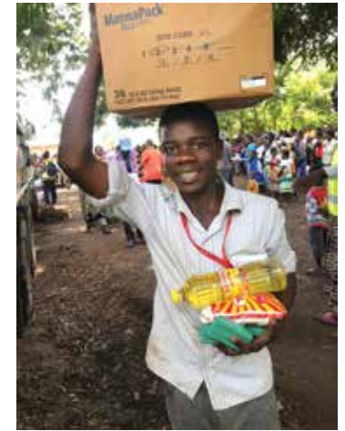
Each family received a box of fortified rice meals, one liter of cooking oil, 2.2 lbs. of salt and four bars of soap.