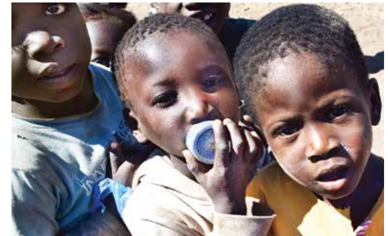
Thank you for being the answer to their prayer!